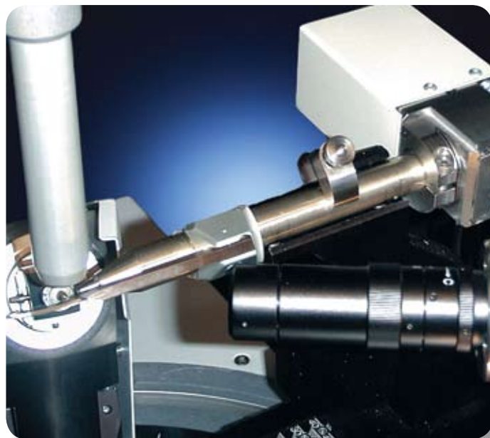
Adding a monocapillary optic is the most cost-efficient way to increase your source intensity.

MONOCAP and MIRACOL optics are suited for Cu and Mo X-ray wavelengths, and provide spot sizes between 0.1 mm and 1 mm in diameter for the MONOCAP and 0.3 mm and 0.5 mm in diameter for the MIRACOL. Both the MONOCAP and the MIRACOL are interchangeable with the standard pin-hole collimator.