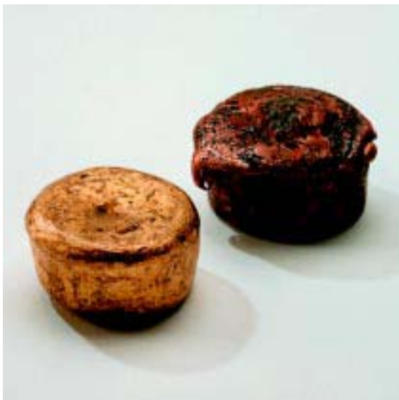
Figure 2: Copper samples

For the correct determination of Oxygen in copper samples (Fig. 2), it is necessary to achieve - after milling, grinding and polishing - a smooth and flat surface. To remove residuals from the polishing paste, it is useful to rinse the sample with acetone. It is important to measure the samples directly after preparation, otherwise the Oxygen concentration will increase due to oxidation on the surface.