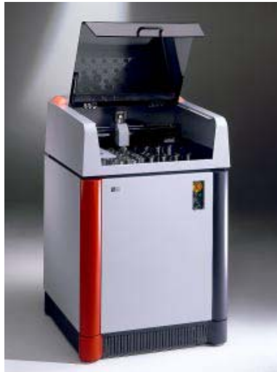
Figure 1: S4 PIONEER

The innovative concept of the S4 PIONEER (Fig. 1), is a new milestone in the development of wavelength dispersive XRF-instruments (WD-XRF). It combines the flexibility of a modern spectrometer with up to 10 primary beam filters, 4 collimators and 8 analyzer crystals with the advantage of 4 kW-excitation reduced to a very small amount of required floor space ( \sim 0.8\text{m}^2 ). The consequent compact design leads to a very high sensitivity, even for light elements like Oxygen, and, therefore, the lowest LLD's can be reached in a very short measuring time. For the determination of Oxygen in copper, the analyzer crystal OVO-55 was combined with the fine 0.46^\circ -collimator. For excitation, the Rh-end-window X-ray tube with a standard 75\mu\text{m} ultrathin Be-window was employed with 27 kV and 150 mA.