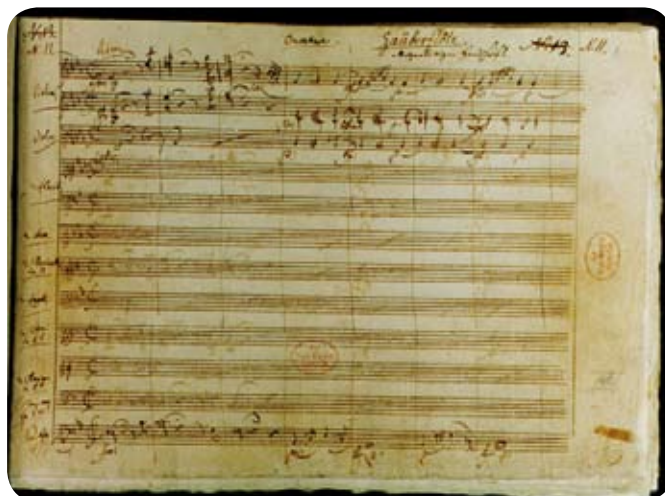
Figure 2: W.A. Mozart, The Magic Flute

During the examination of iron gall ink the main component Fe was standardized ( \equiv 1 ) for that reason. The other components could then be quantified relative to iron