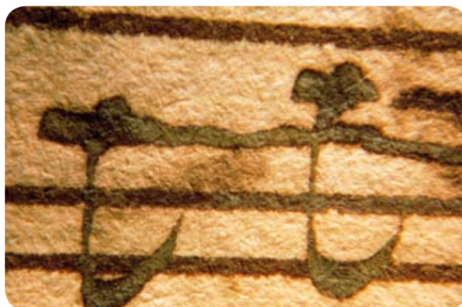
Figure 3: Johann Sebastian Bach Serenade for Leopold of Saxony-Koethen