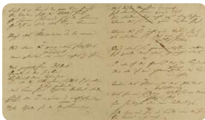
Figure 4: J.W. von Goethe, Faust II