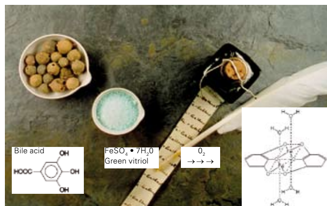
Iron pyrogallol complex